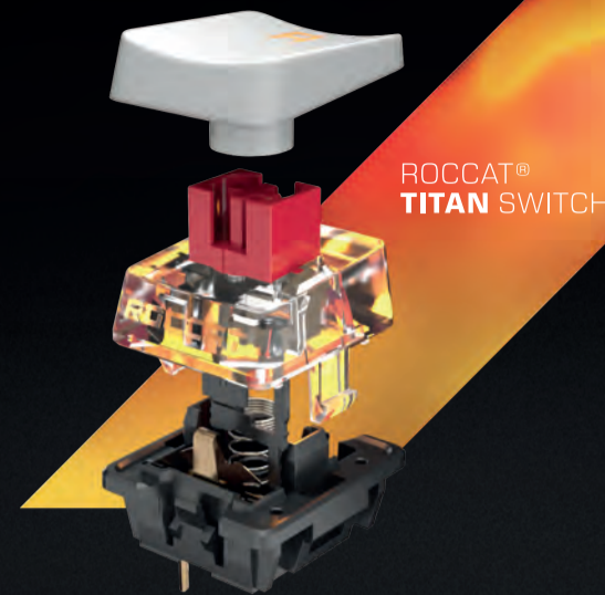
ROCCAT® TITAN SWITCH

Thank you for choosing the Vulcan AIMO and welcome to the ROCCAT® family. A finely tuned trio of speed, durability and illumination, the Vulcan packs a powerful punch. It's also the first keyboard to feature ROCCAT's exciting new mechanical Titan Switches. Developed from the ground up in their entirety, they deliver the precision ROCCAT has come to be known for. Altogether, the Vulcan represents a high performance gaming keyboard unmatched by its competitors.